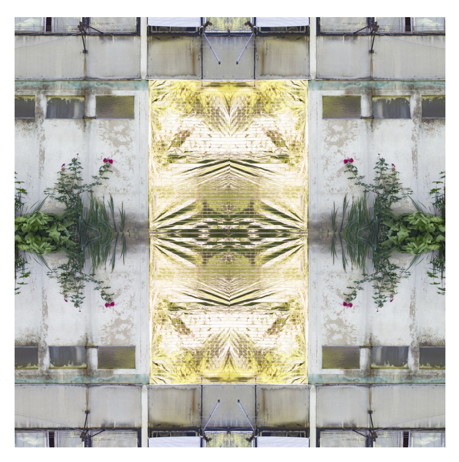
The Shining. Collage by Selma Banich, 2020.

The Shining (2017),<sup>1</sup> a temporary intervention on the surface of a social housing façade in Folnegovićevo naselje , attempted to establish a connection between the various inhabitants of the modernist buildings (the prefab \times tin-can housing units built in the 1960s that require urgent solutions for both their dampness and dilapidation